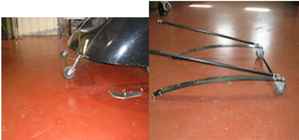
VW solid mount to bumper bucket.